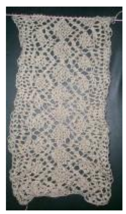
I charted this design from an insertion panel appearing in the June 1898 edition of The Delineator Magazine . At one time the original page of instructions from which I graphed this was available at the Vintage Collection crochet and knitting website – now defunct.

© Kim Salazar, 2007, 2012; http://www.string-or-nothing.com